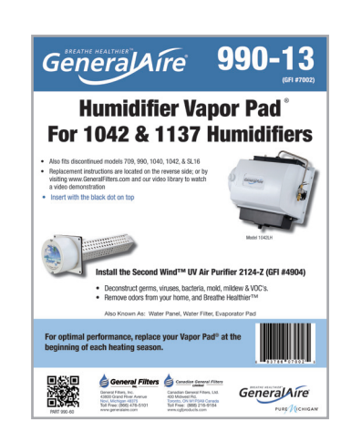
GF-990-13 Vapor Pad®